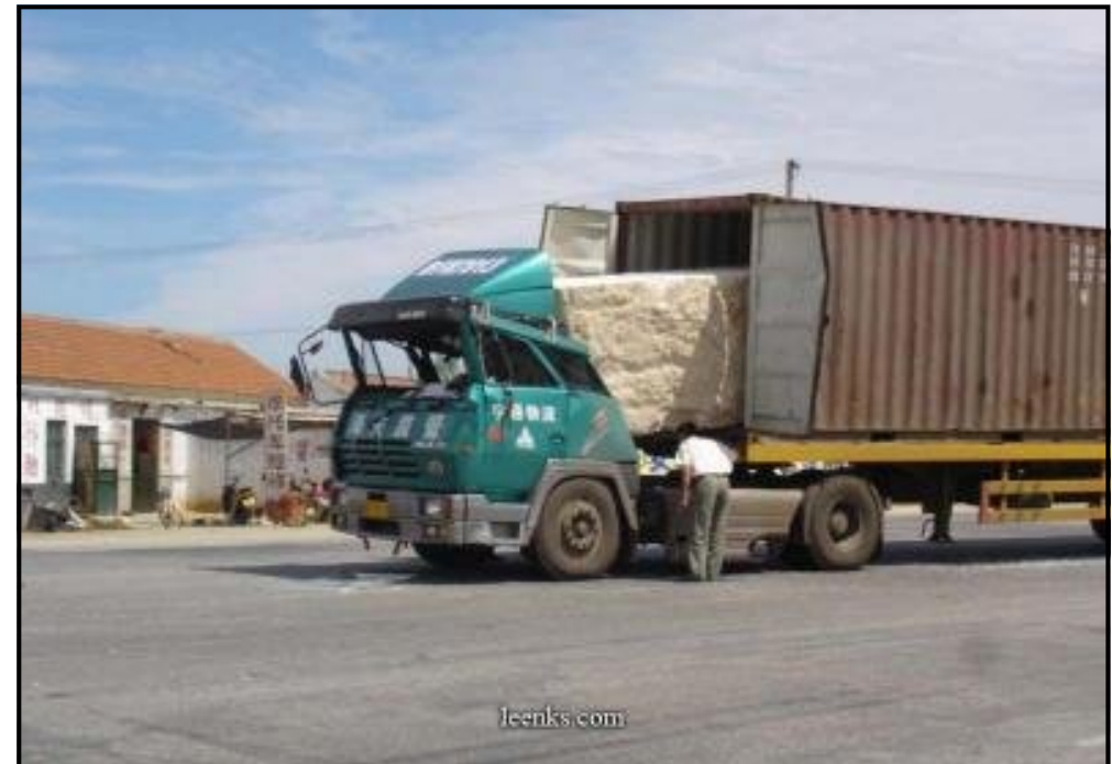
"I told you to get that load secured ...."