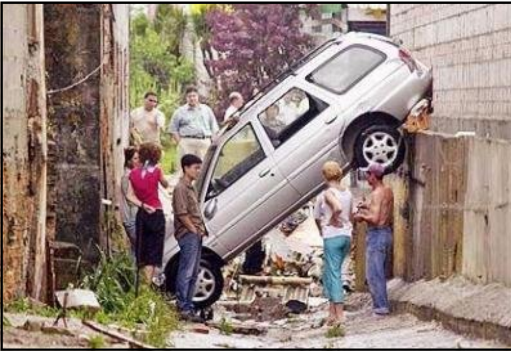
Is that really how you execute a three point turn?